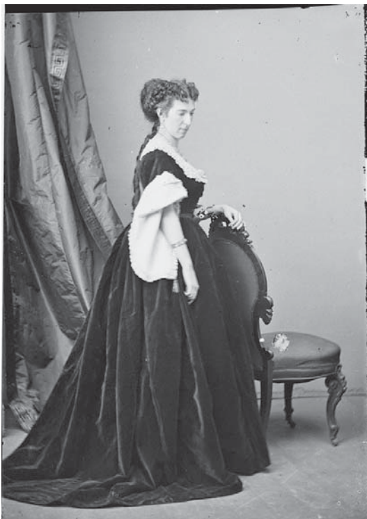
Figure 1 Belle Boyd . Created between 1855 and 1865. Negative, glass, wet collodion. Located at the Library of Congress Prints and Photographs Division.

Unfortunately, these qualities also provided ammunition for her detractors, largely the Northern media, who painted her as a camp follower or prostitute. 1 No evidence exists to support those charges and the fact that Boyd was a successful Confederate spy mitigates them in posterity, considering the source. Such disparagement, however, when combined with Boyd's own tendency to sensationalize and self-aggrandize in her memoirs has cast her reputation and accomplishments in doubt to