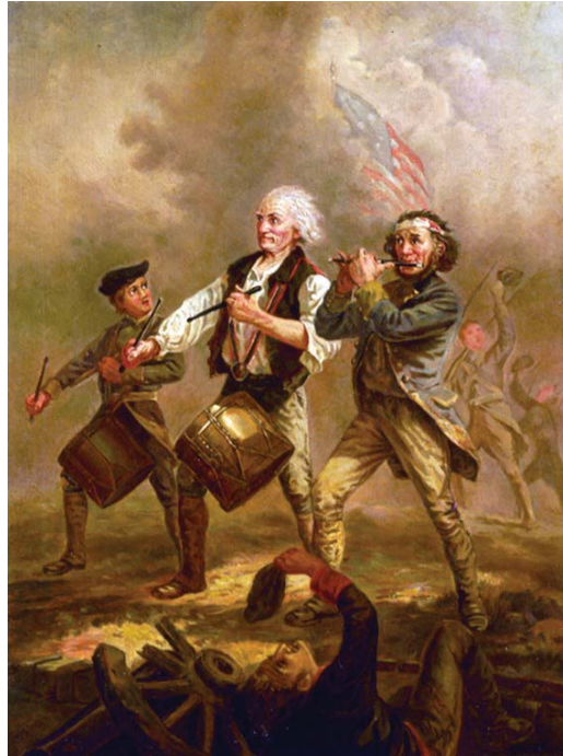
Figure 1 Spirit of '76 . Oil on canvas by Archibald Willard, 1875. The original hangs in Abbot Hall, Marblehead, MA.