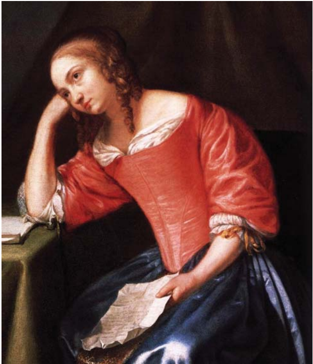
Figure 1 Young Girl Holding a Letter . Oil on canvas by Caspar Netscher, c. 1665. Private collection.

This rise in expectations accompanied increased discussion over the nature and capabilities of women. Not only were there new ideas, but increased trade, the Union of the Crowns in