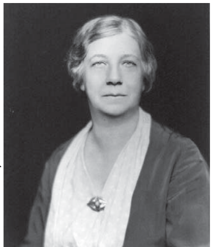
Figure 1 Mary Ritter Beard.

When attempting to understand women's position in history, it is important to