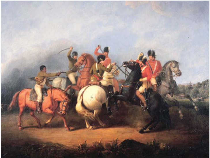
Figure 2 Battle of Cowpens . Oil on canvas by William Tylee Ranney, 1845. Located at the South Carolina State Senate.

“Green Dragoons,” Lieutenant Colonel Banastre Tarleton, in a sword fight, Washington suddenly found himself in deadly danger. An African-American bugler, described as a fourteen-year-old Virginian by historian Burke Davis, raced to the scene, and shot a British officer who had joined Tarleton in the counterattack on Washington. There is very little information known about Washington’s small savior. Davis described