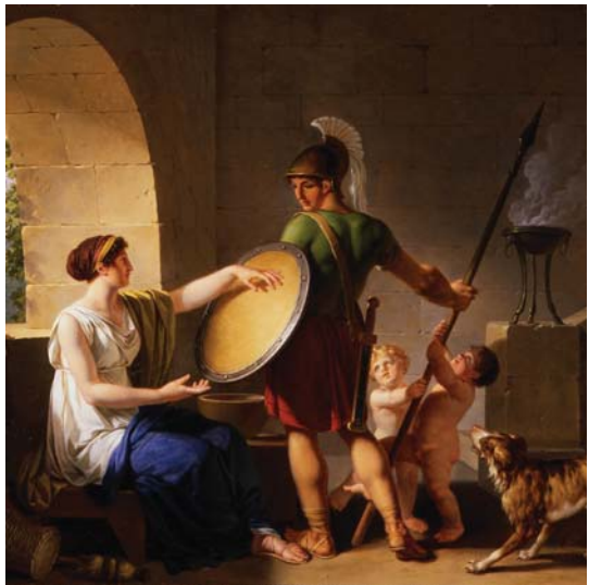
Figure 1 A Spartan Woman Giving a Shield to her Son . Oil on panel by Jean Jacques François Lebarbier, 1805. Held by the Portland Art Museum in European Art Collection.

The greater freedoms of Spartan women began at birth; families treated females just as well as male babies. “It was the only Greek city in which woman was treated almost on equality with man.” 19 Spartans educated them much in the same way as the boys attending school and encouraged them to participate in sports. Nardo states that according to Xenophon, strong, healthy, physically active girls and women bred healthy children for the state. 20 Spartan women had to be almost as educated as men because they were expected to take care of their interests and