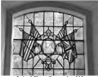
Stained Glass tribute to Arnold 1

the recognition he had craved all his life when an American admirer