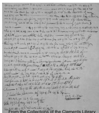
Coded letter from Arnold to Andre