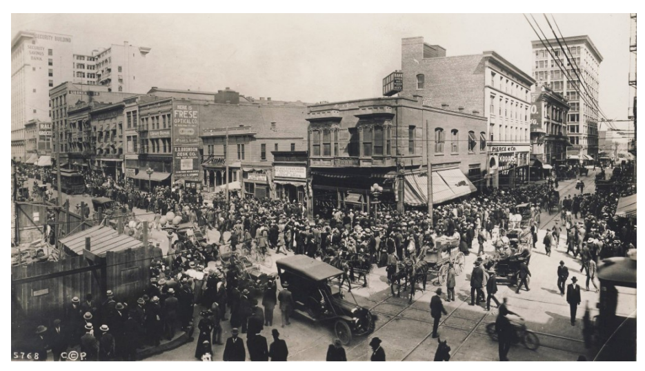
Figure 1 A panoramic image capturing the corner of 5th and Spring Streets captured by C. C. Pierce & Co., Los Angeles. C. 1910

Although automobile traffic increased rapidly in the first two decades of the twentieth century, the question of who owned the city street was still unanswered. The rivalry between cars and pedestrians was the most heated. Pedestrians forced from the street by automobiles blamed the problem on "joy riders," and irritated drivers referred to pedestrians as "jaywalkers."<sup>4</sup> This battle