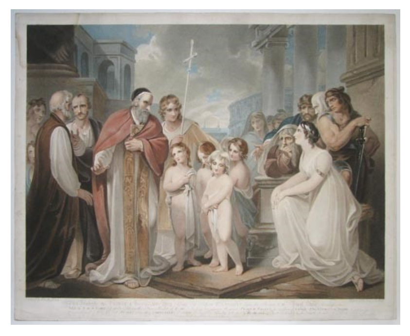
Figure 2 St. Gregory before his Elevation to the Royal Chair observing some Children of Great Beauty set up for Sale in the Slave Market at Rome, Painted by Heny Singleton, engraved by Piercy Roberts, 1801.